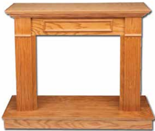
Wood mantels in a variety of styles and finishes